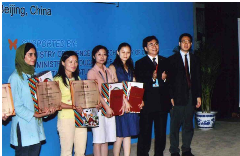
Best Poster Award