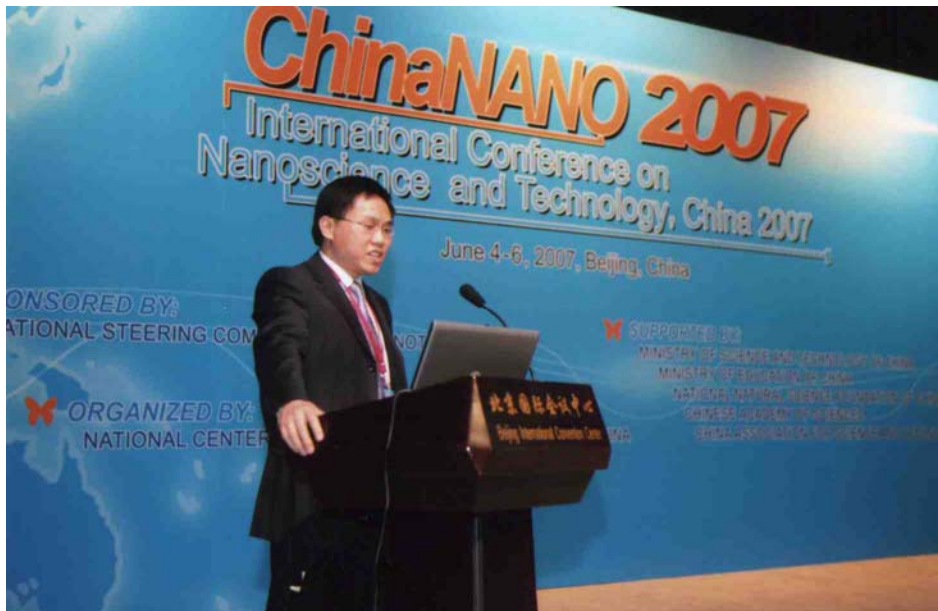
Plenary Speaker: Prof. Yadong Li